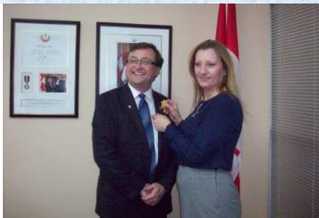
Above - Cancer Month Daffodil Kick Off April 1st 2014. Right - Battle of the Atlantic Ceremony at Spencer Smith.